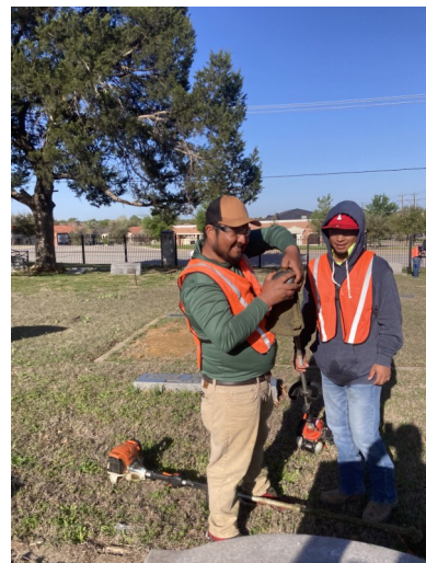
TCSO volunteers doing maintenance on equipment