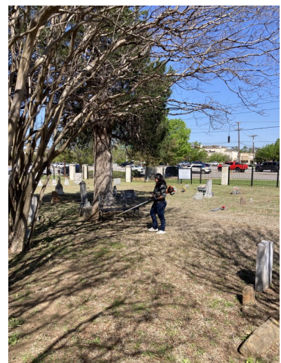
Littlepage family members