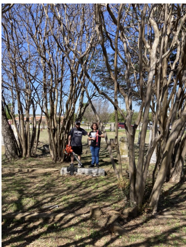
Littlepage family members working on family plot