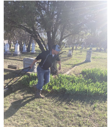
TCSO volunteer mowing